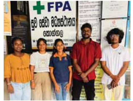
Youth Club Meeting –Koggala SDP