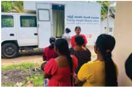
Mobile Clinic in Nawagaththegama Puttalam SDP