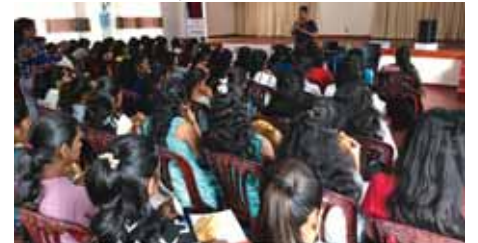
Youth Camp in Passara Moneragala SDP