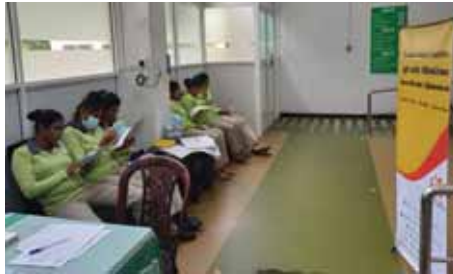
Mobile Clinic at CBL (Munchee) Exports – Seethawaka SDP