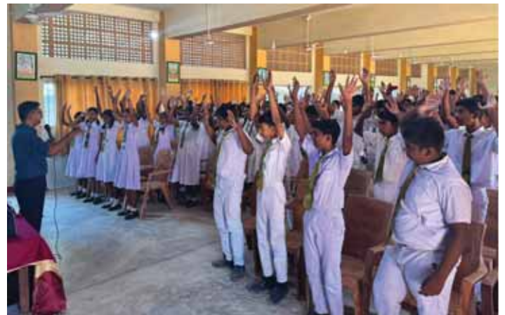
CSE session at BT/ Puthukkudiyiruppu Kannaki Maha Vidyalayam – Batticaloa SDP

The Outreach Unit has been actively engaged this quarter in conducting Comprehensive Sexuality Education (CSE) workshops, mobile clinics, and facilitating youth club meetings across Service Delivery Point (SDP) branches, while also organizing youth camps in Cyclone Ditwah-affected areas, strengthening community outreach and youth engagement at community level. Here are some picture highlights.