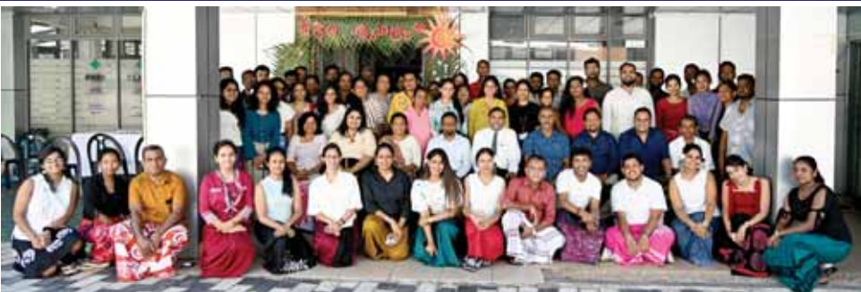
The FPA Sri Lanka team welcomed the New Year on the 20 th of April at the Head Office, with fellowship games and festive treats, celebrating unity, cultural pride, and the spirit that drives our work.

We want to hear your views and suggestions! Please write to: FPA Sri Lanka, 37/27, Bullers Lane, Colombo - 07, Sri Lanka.