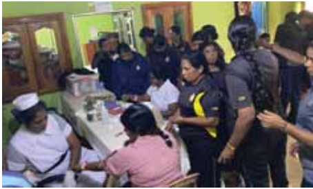
Mobile Clinic for the Civil Security Department – Kanagapuram Camp – Killinochichi SDP