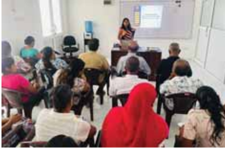
Disaster Management Working Group Discussion – Pallekelle SDP