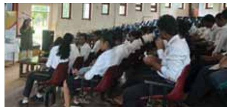
CSE Session for Attanagalla Youth Corps – Wathupitiwala SDP