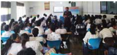
CSE Session at Youth Training Centre – Ampara SDP