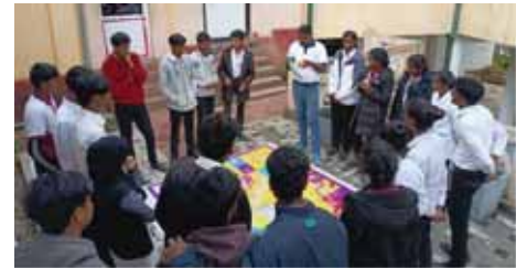
Youth Camp at the Vocational Training Authority (VTA) Nuwara Eliya SDP