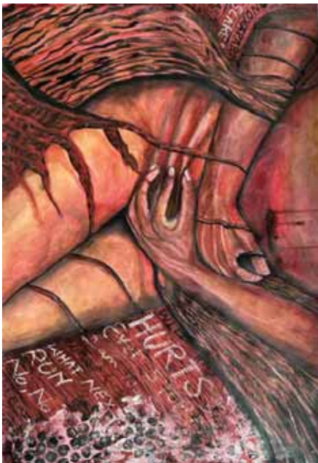
Artist: Shehara Silva Medium: Mixed media First Place