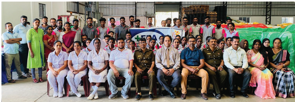
Mobile Clinic at East Lanka Polysack (PVT) LTD in Nasuvantheevu by the Batticaloa SDP

Our mobile clinic bus has been on a mission to reach the women of the Pallama MOH areas in Puttalam, especially those in the 35 - 45 age group who haven't been able to access well-woman clinics. The Puttalam SDP has been actively reaching out to remote villages, such as Wanathawilluwa, located near the Wilpattu National Park.