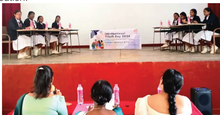
The debate competition held at the Galle Dikkumbura Sri Siddhartha School was organized by the Koggala SDP

In celebration of International Youth Day, several SDPs hosted debate competitions on the topics: 'The absence of comprehensive sexuality education can lead to contemporary social issues' and 'Do young people need reproductive health education?'