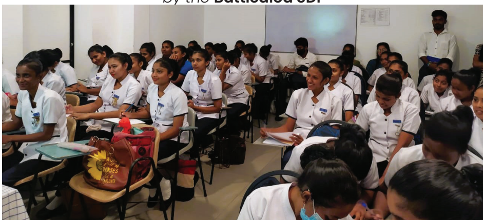
CSE programme at the SMI School of Nursing by the Seethawaka SDP