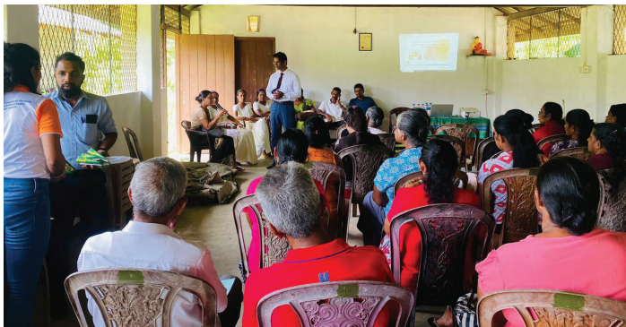
Session at Vidyathilaka Piriwena, organized by the Wathupitiwala SDP

We are excited to announce that community awareness programmes have been launched in frequently disaster-affected areas of Gampaha, Nuwara Eliya, Galle, and Batticaloa districts, focusing on the prevention of Sexual and Gender-Based Violence (SGBV) in emergency settings. This initiative is supported by the Disaster Management Centre.