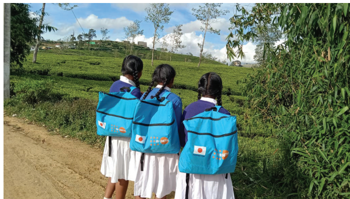
Distribution by the Nuwara Eliya SDP

Supported by UNFPA Sri Lanka and the People of Japan, FPA Sri Lanka has successfully launched the distribution of Adolescent Hygiene Kits via all SDPs, following engaging menstrual hygiene awareness sessions.