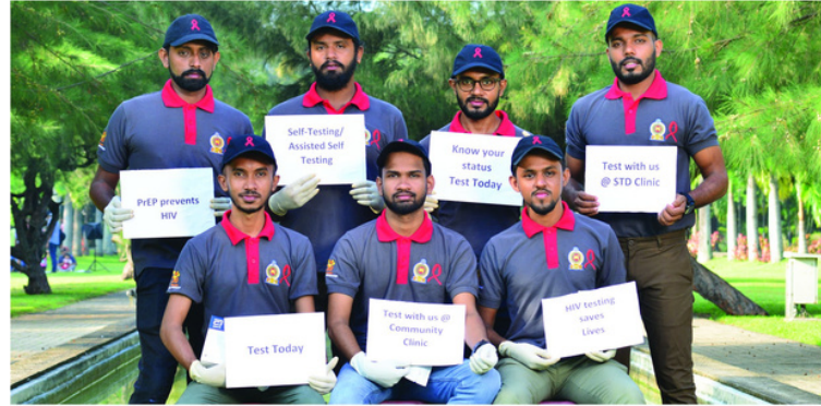
Heart to Heart Team - Colombo District Hotline Numbers: 0112 368 218, 0775 753 005

FPA works with the community and key population-led organisations in Colombo and Gampaha that employ outreach workers trained to provide a service package that includes prevention services, condom and lubricant distribution, case finding, linking to PrEP clinics and conducting Rapid testing for community members.