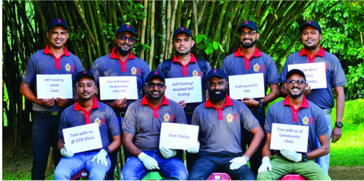
Strategic Alliance for Research and Development (SARD) - Gampaha District Hotline Number: 0740 997 474

"The correct and consistent use of condoms will prevent HIV."