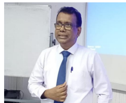
Dr. Ariyaratne Manathunge National STD/AIDS Control Programme

KNOW4SURE is an online reservation system/web app that aims to provide the most convenient means to assess your level of risk and make reservations for HIV testing services with the National STD/AIDS Control Programme (NSACP) and preferred private practitioners for rapid HIV screening tests while handling data ensuring anonymity and privacy. Home delivery services to deliver health products such as HIV self-test kits, condoms and lubricants to the doorstep are also offered through this platform.