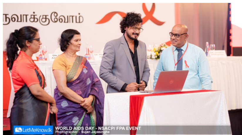
Launch of the 'Celebrity Voices' campaign.