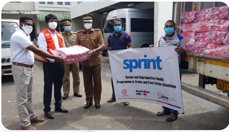
Donation at the Prison Headquarters.